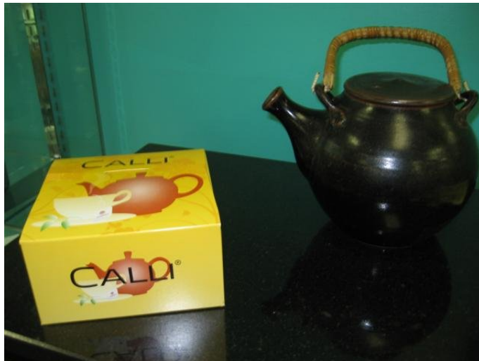
Calli – Regular, Mint, Cinnamon

Fortune Delight – Contains Camellia Extract, Lemon Extract, Chrysanthemum Extract, Jasmine Extract, Lalang Grass Root Extract