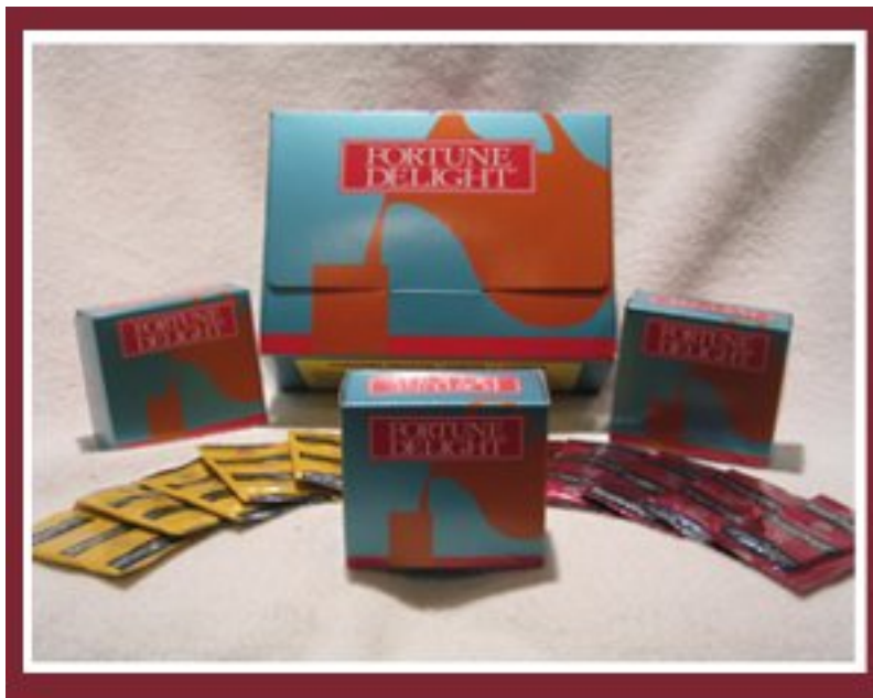
Fortune Delight – Lemon, Peach, Raspberry, Regular, Cinnamon

This is for information purposes only and is separate from Sunrider International. It is not intended as medical advice. As with any medical problem, consult your physician.